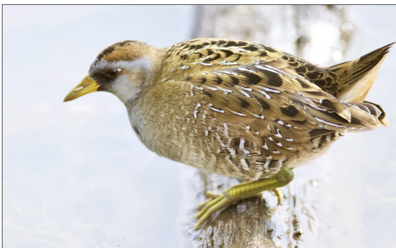
Sora foraging in Huntley Meadows wetland, February 2021.

Quality wildlife viewing at HMP also depends on visitors talking at normal volumes, refraining from using amplified sound, and not riding scooters, hover boards, or bikes on trails where prohibited. On the boardwalk, we ask that visitors avoid running or making other movements that would cause the water to vibrate and pose a perceived threat to animal safety. Pets can provide another potential threat to wildlife both real and perceived, so pets are not permitted on the Heron Trail (boardwalk trail) or the Restoration Trail (gravel trail on South Kings Highway side of Park).