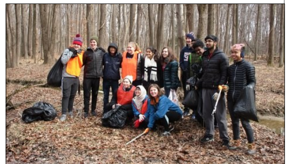
Student volunteers gather following an HMP stream trash pickup, spring 2019.

See you soon, perhaps while volunteering!