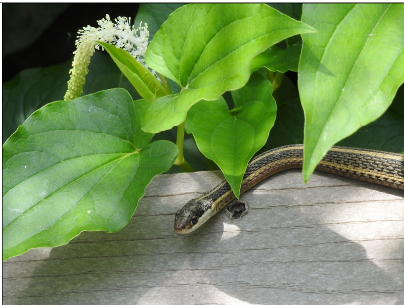
Ribbon Snake on central wetlands boardwalk in front of blooming Lizard’s Tail ( Saururus cernuus L.).

Both paved bike trails are likely to have significant adverse impacts upon HMP’s rare species and ecosystems. Both trails and their associated substructures would have a significant footprint on the ground, eliminating important vernal pools and other habitats used by State-designated rare wildlife and plants. Moreover, because of the low-lying, often wet ground and unconsolidated soils, both paved bike trails would likely need dikes or similar structures to elevate them. Each paved trail, with its supporting structure, would therefore likely function as a dam, changing the water flow regime and probably also the surrounding vegetation. In