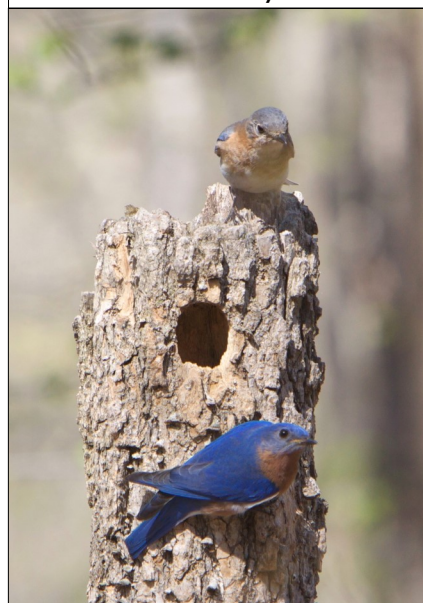
Eastern Bluebird pair sitting on natural nest.