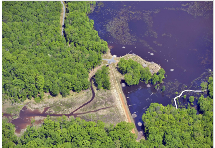
Arial photo of completed berm (straight line in the bottom middle of photo) backing up the water and creating wonderful wildlife habitat.

The current Fairfax County Department of Transportation (DOT) proposed paved bike trails are specifically intended for transportation and commuting. Construction of the northern proposed paved trail would entail the same conversion of this portion of the Park to a transportation corridor as was proposed in the late 1980s. Due to the deed restrictions for HMP property, pursuing such construction would most likely require federal approval and additional costly actions, including a detailed, site-specific environmental review which has never been done for these proposed trails.