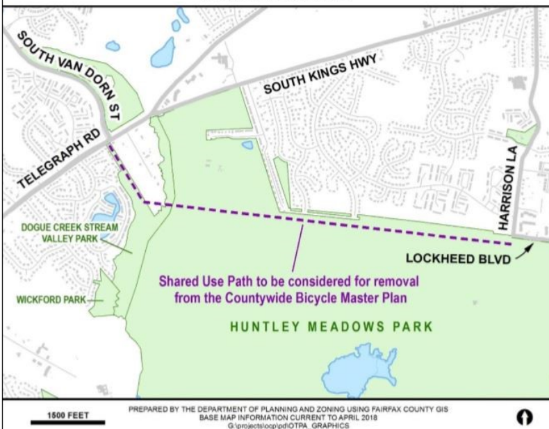
Huntley Meadows Park Path from Telegraph Road to Lockheed Boulevard ITEM: PA 2018-IV-BK1

Huntley Meadows Park Path from Telegraph Rd to Lockheed Blvd. shown via purple dotted line.